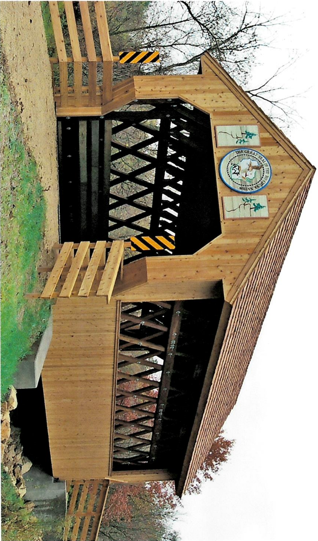
Covered Bridge - Example 1