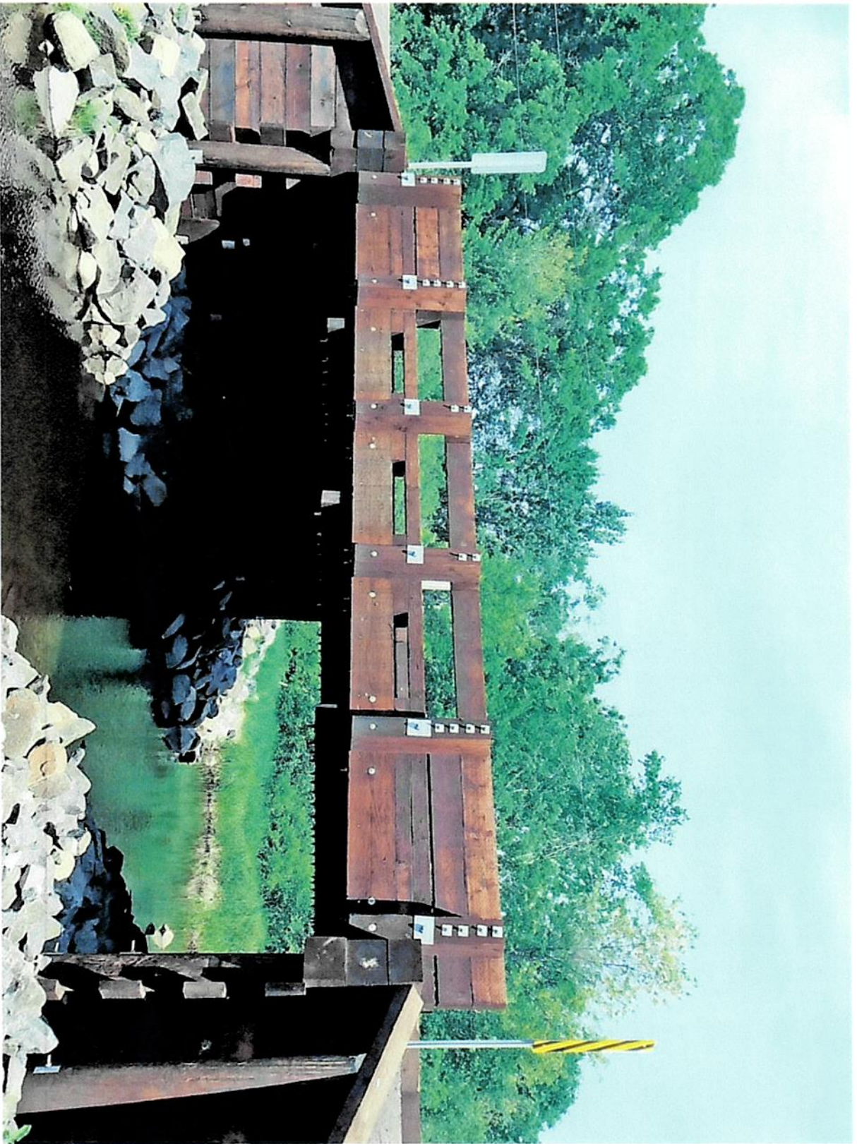
Option 1 - Single-span timber