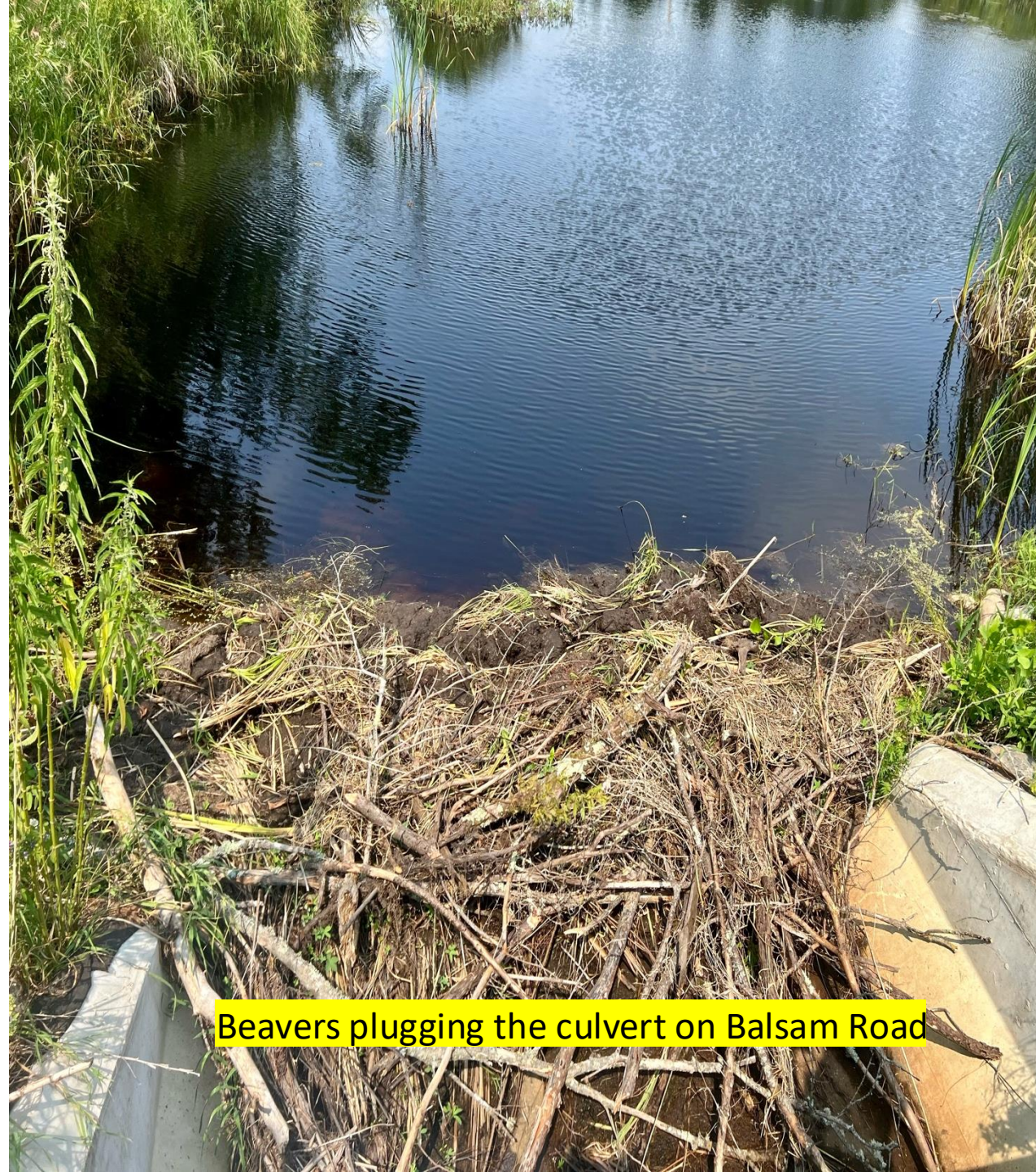
Beavers plugging the culvert on Balsam Road