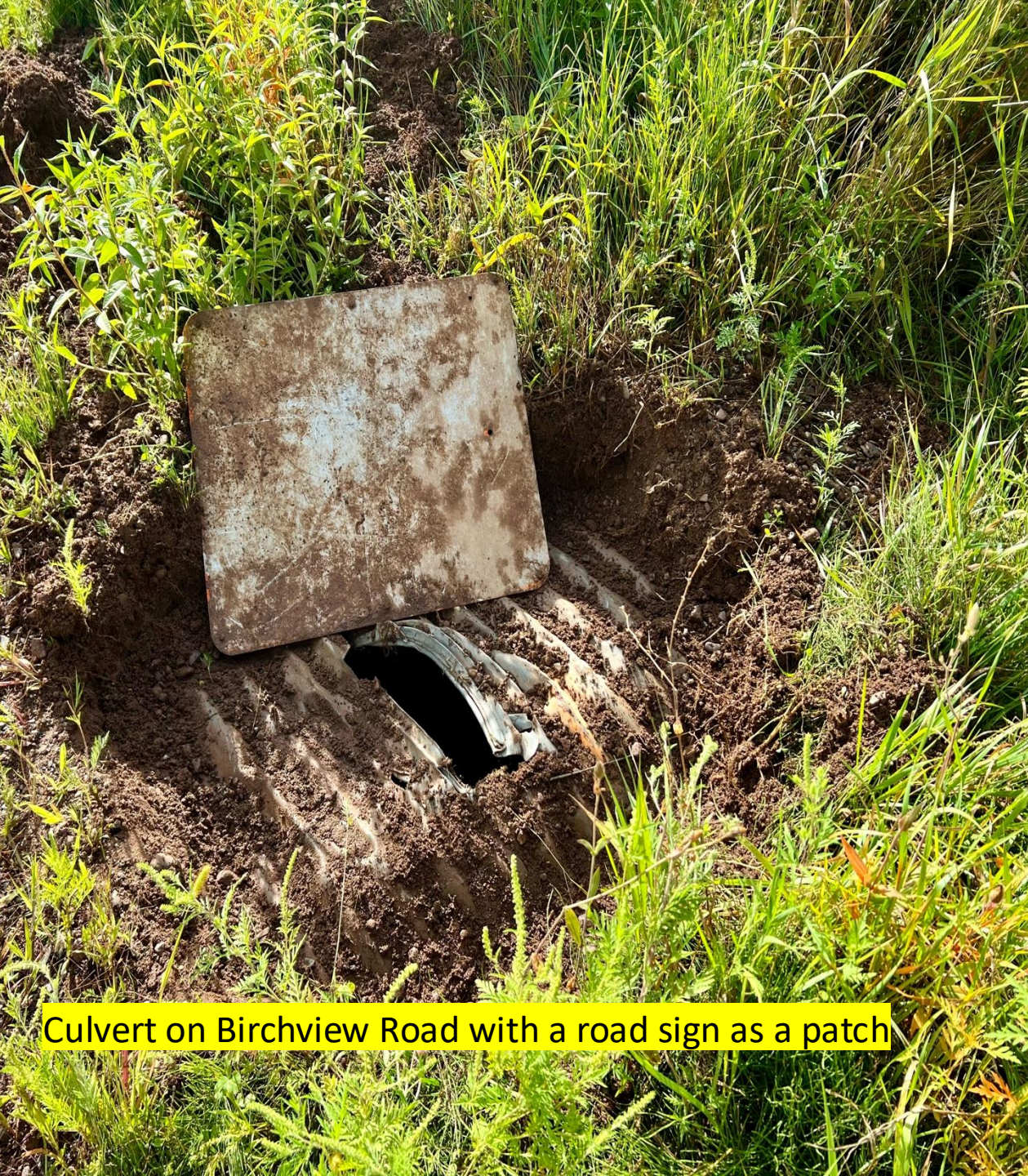
Culvert on Birchview Road with a road sign as a patch