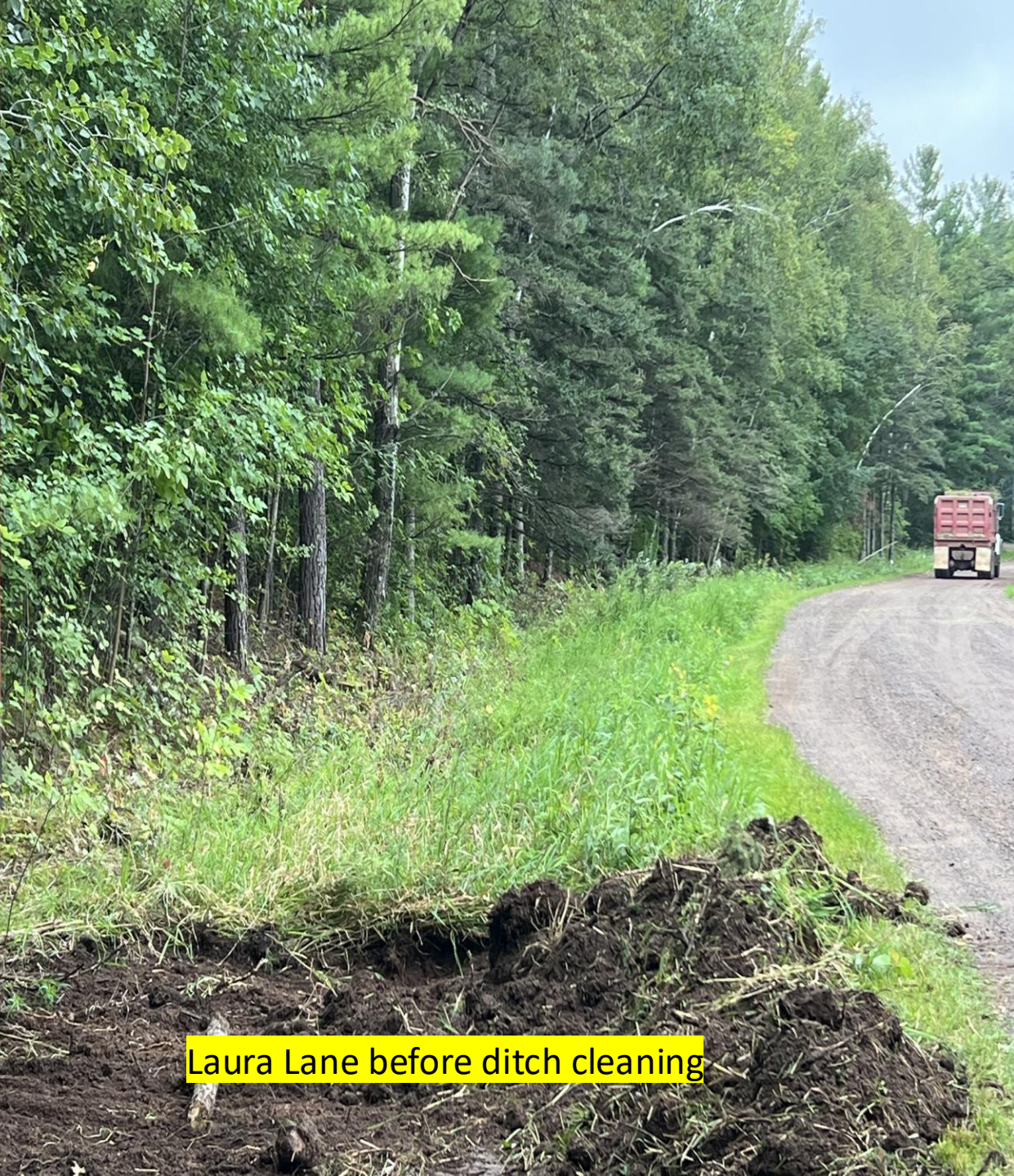
Laura Lane before ditch cleaning