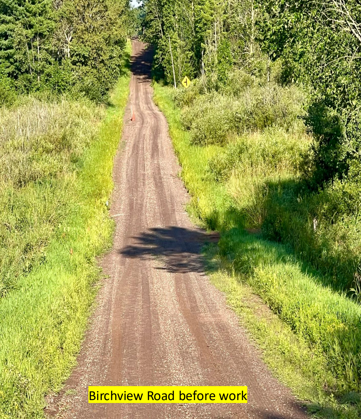
Birchview Road before work