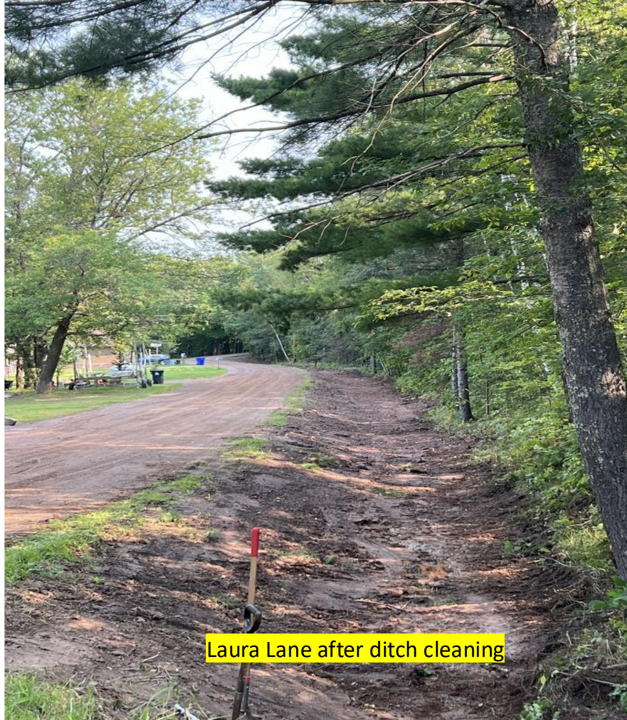
Laura Lane after ditch cleaning